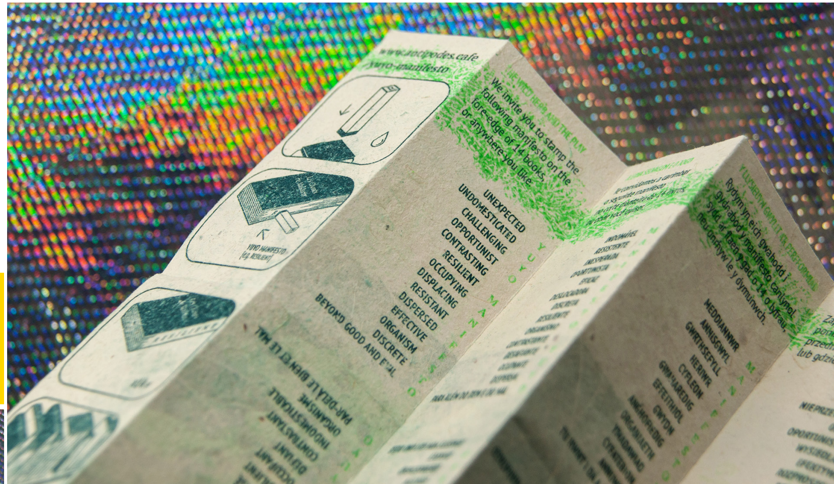
Pamphlet: side b "Instructions" and 8 translations of the "yuyo manifesto" (English, French, Portuguese, German, Welsh, Basque, Polish, Norwegian)

The publication features the manifesto in languages of places where the organization performed varied cultural initiatives during the past decade, and an invitation to apperceive it on its appropriation.