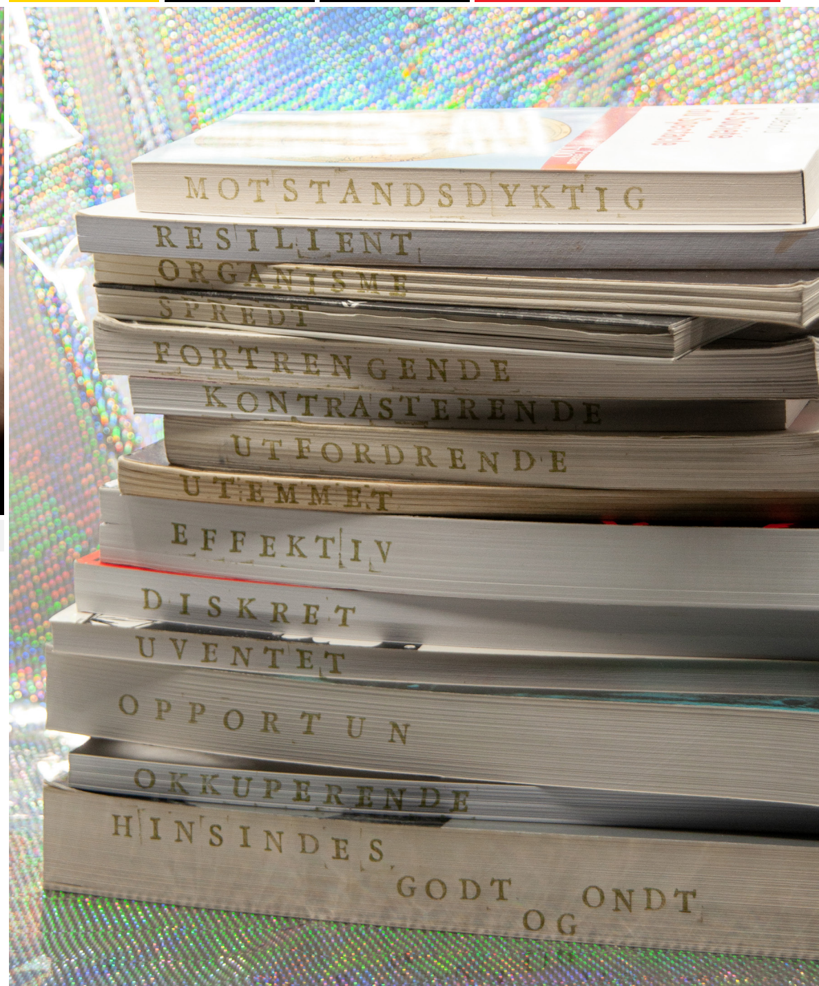
yuyo manifesto red-handed

Following those instructions and using the included tools, one can put the manifesto in action. One can correct it, change it and even germinate it, as all included artisan papers are embedded with seeds from 10 wild flowering plants.